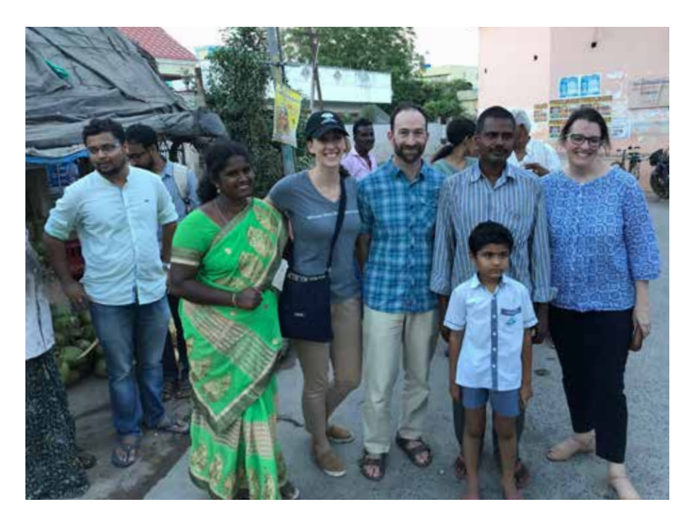
Tufts and Woodwell Climate Research Center researchers with Indian farmers.