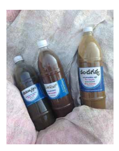
Fertilizers and bio-pesticides produced by ZBNF farmers.