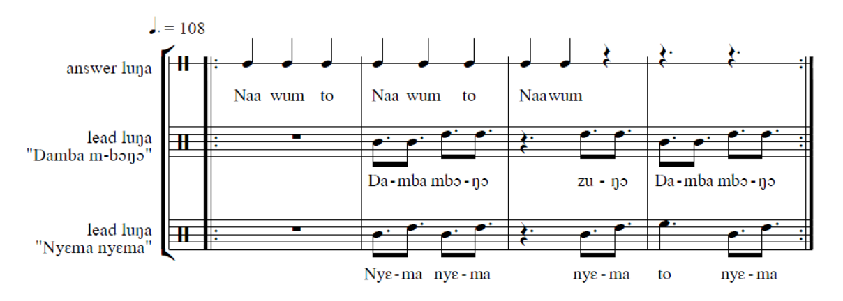
Figure 2 Damba Sochendi, rhythmic similarity of two lead luna themes

Alhaji gave three drum talks for Damba Sochendi. Two of the talks have almost identical stroking rhythms but different melodies (see Figure 2). The design of sound and silence in these themes result in both overlap and call-and-response between the lead and answer luna drum parts. Their simultaneous play creates 4:3 rhythmic relationships.