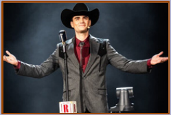
Conservative commentator Ben Shapiro wearing a cowboy hat during a livestream of his eponymous show, October 2021