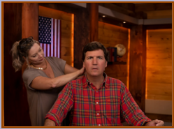
Conservative commentator Tucker Carlson donning aesthetically rural clothing on his show, Tucker Carlson Today , July 2021