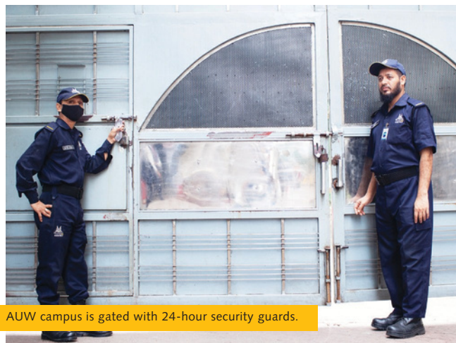
AUW campus is gated with 24-hour security guards.

AUW takes seriously the health and safety of all staff and students. There is a free on-site Health & Wellness Center that cares for the medical and psychosocial needs of the university community. There are hospitals nearby. All Fellows will be covered by a health insurance plan with NOW Health International. This policy is in effect for all countries outside the United States, not only in Bangladesh.