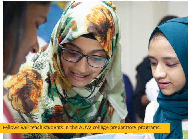
Fellows will teach students in the AUW college preparatory programs.