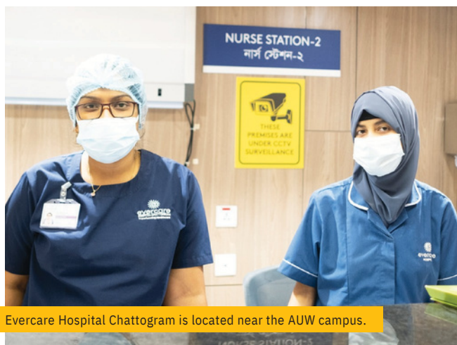
Evercare Hospital Chattogram is located near the AUW campus.

AUW will purchase all airline tickets. Fellows should work with AUW to identify appropriate flights to and from their homes. Fellows should arrive in Chittagong by mid-July 2024. Fellows will obtain their own visas, working with AUW to provide the needed documentation. For visas Fellows will need a letter from Bangladesh authorities, a governmental agency, and an invitation letter from the university. Fellows will be reimbursed the cost of the visa when they arrive in Chittagong.