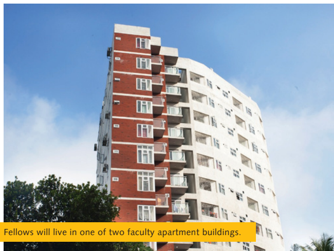
Fellows will live in one of two faculty apartment buildings.

Fellows will be able to immerse themselves in Bangladesh and surrounding regions. There may be opportunities to visit the Rohingya refugee camps in Bangladesh; visit garments factories where AUW recruits students; see natural habitats of wildlife unique to the region; and learn about industry issues in Bangladesh. Chittagong is Bangladesh's second largest city with considerable income inequity; Fellows can expect an intense but deeply rewarding experiences living and working in Chittagong, which is also referred to as Chattogram. We seek Fellows who are eager to adapt and learn through the new experiences they meet at AUW.