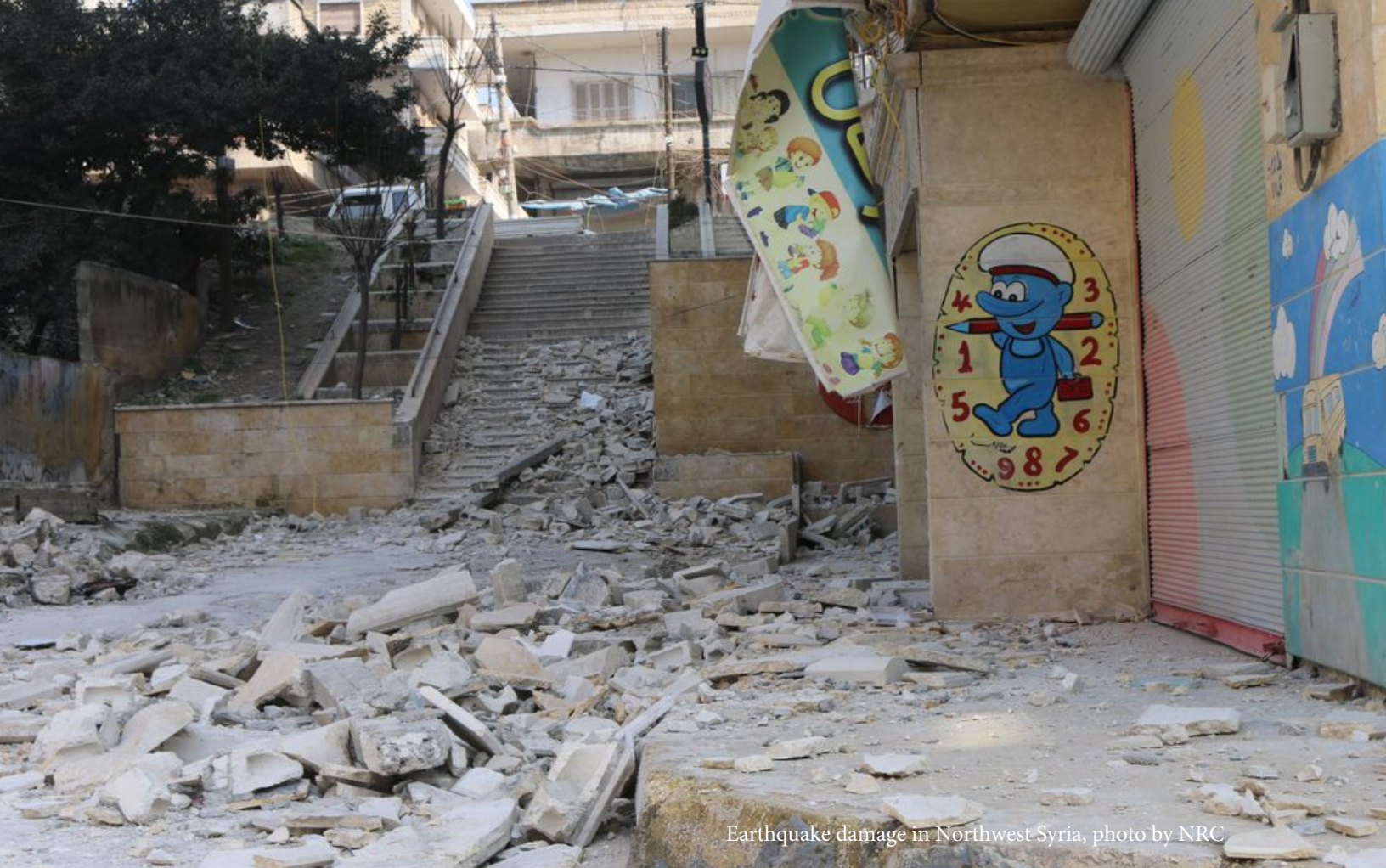
Earthquake damage in Northwest Syria