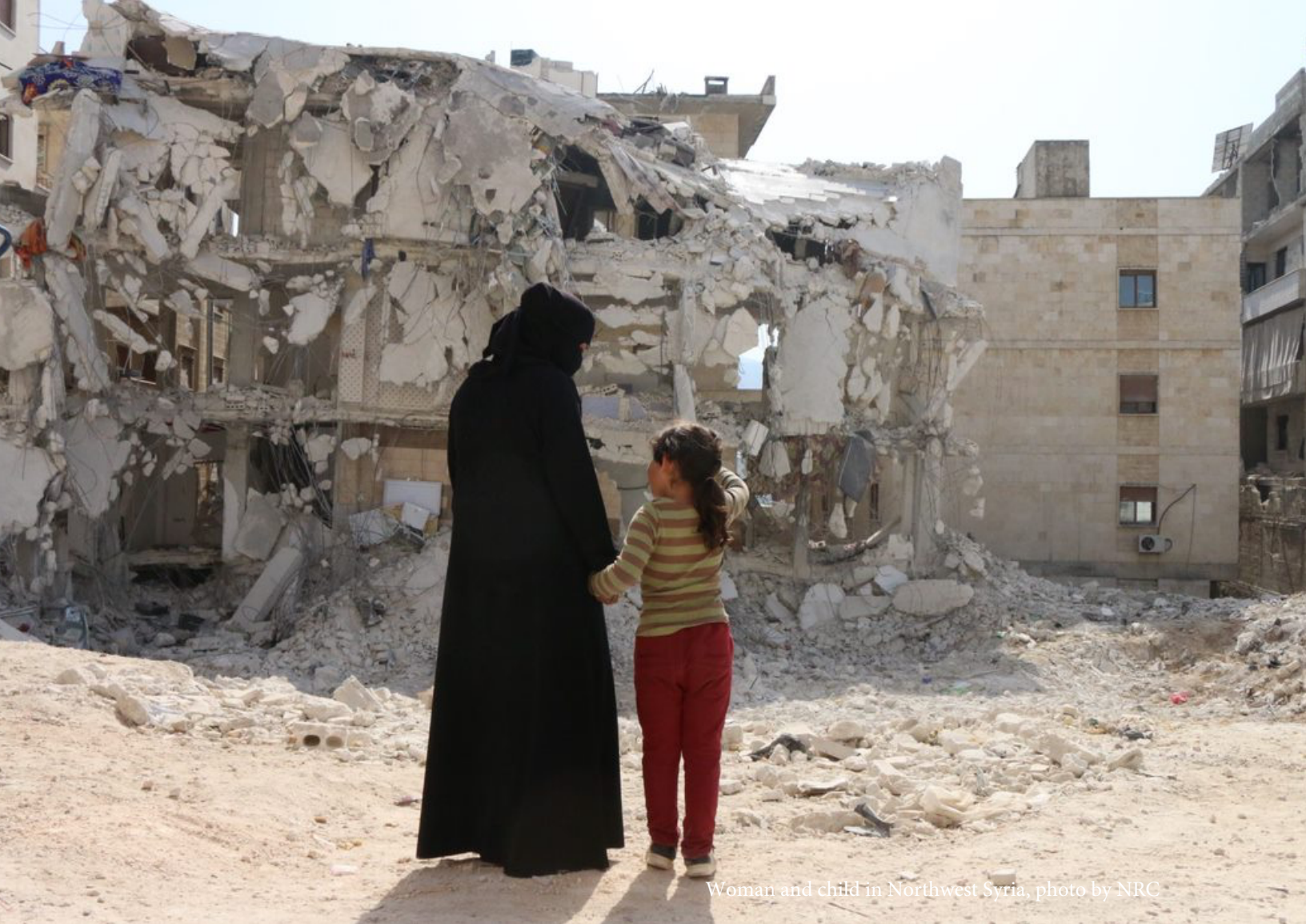
Woman and child in Northwest Syria