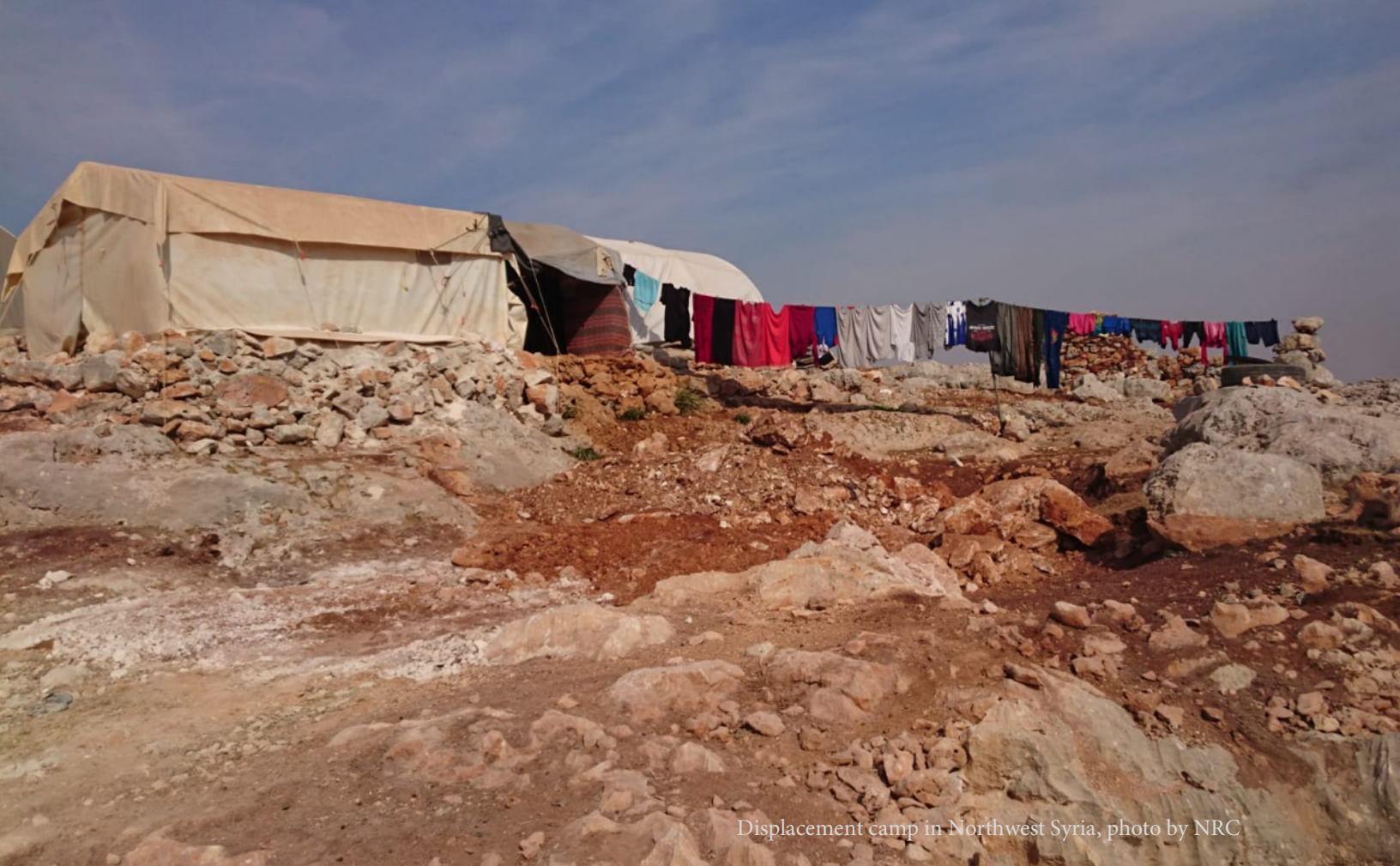
Displacement camp in Northwest Syria