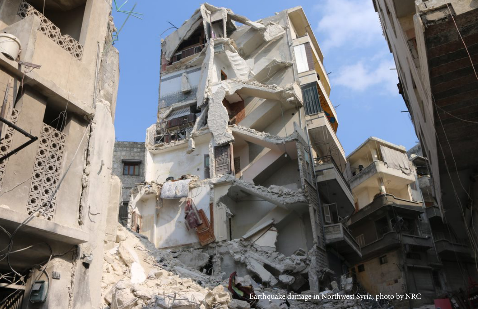
Earthquake damage in Northwest Syria