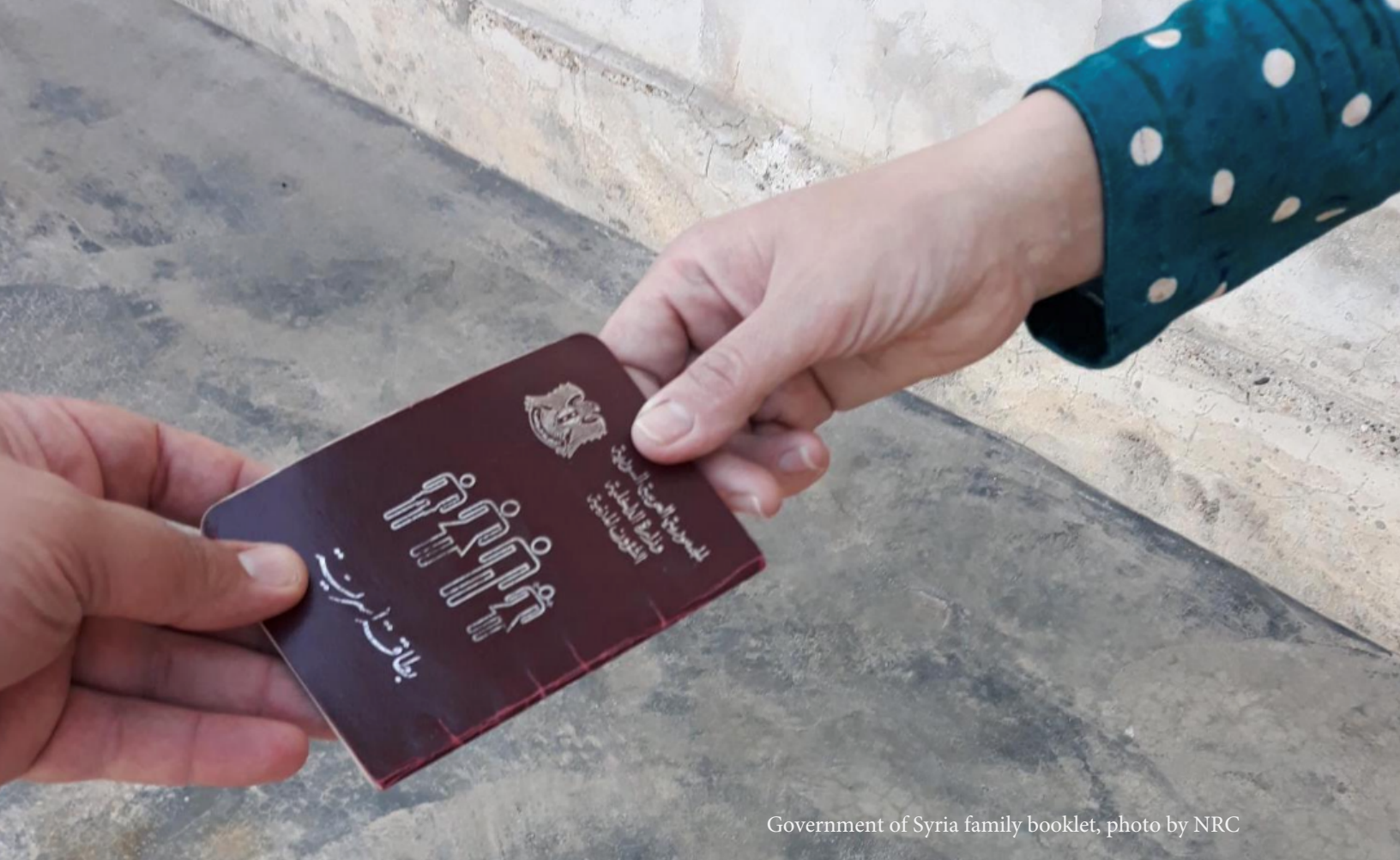
Government of Syria family booklet, photo by NRC