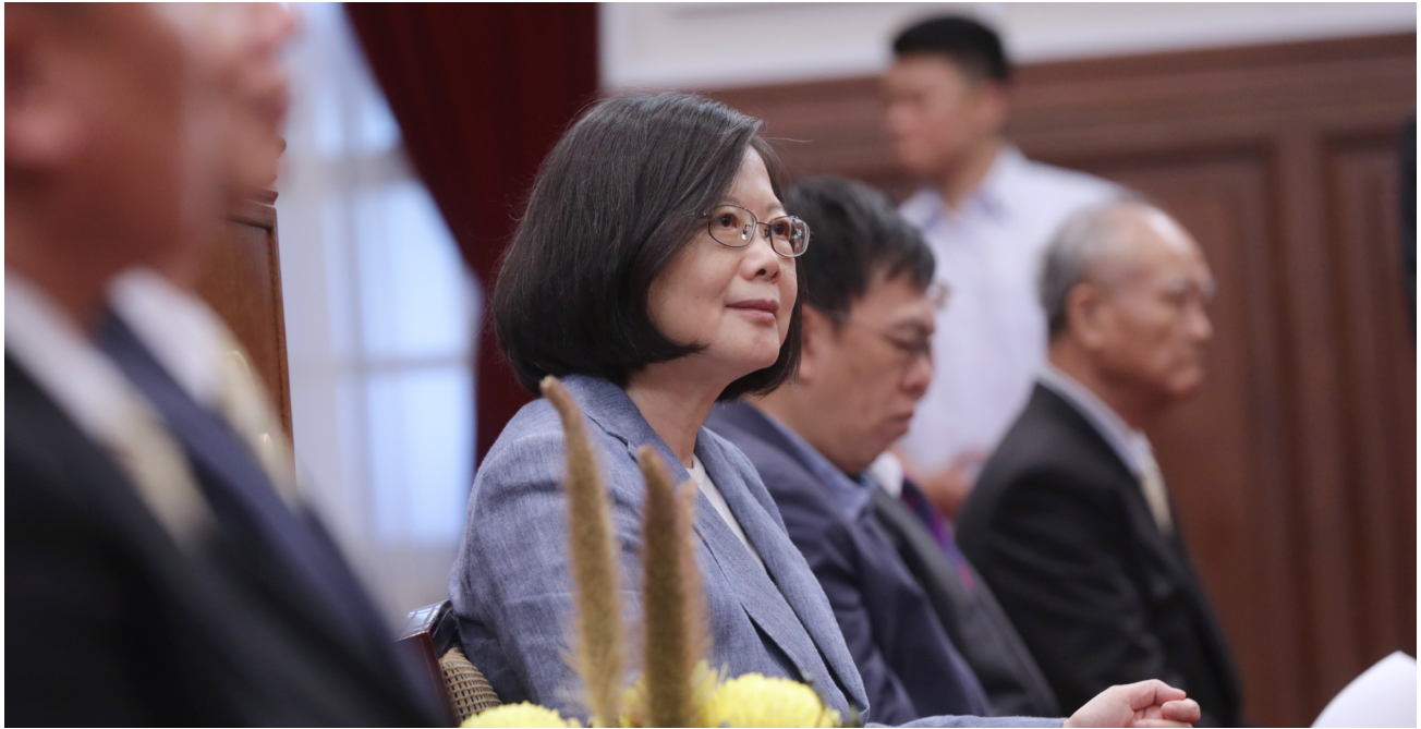
Taipei, Taiwan. President of Taiwan Tsai Ing-wen meets with government officials.

sing landslide against the Kuomintang (KMT) opponent. In your opinion, what implications does this have for the future of cross-strait relations?