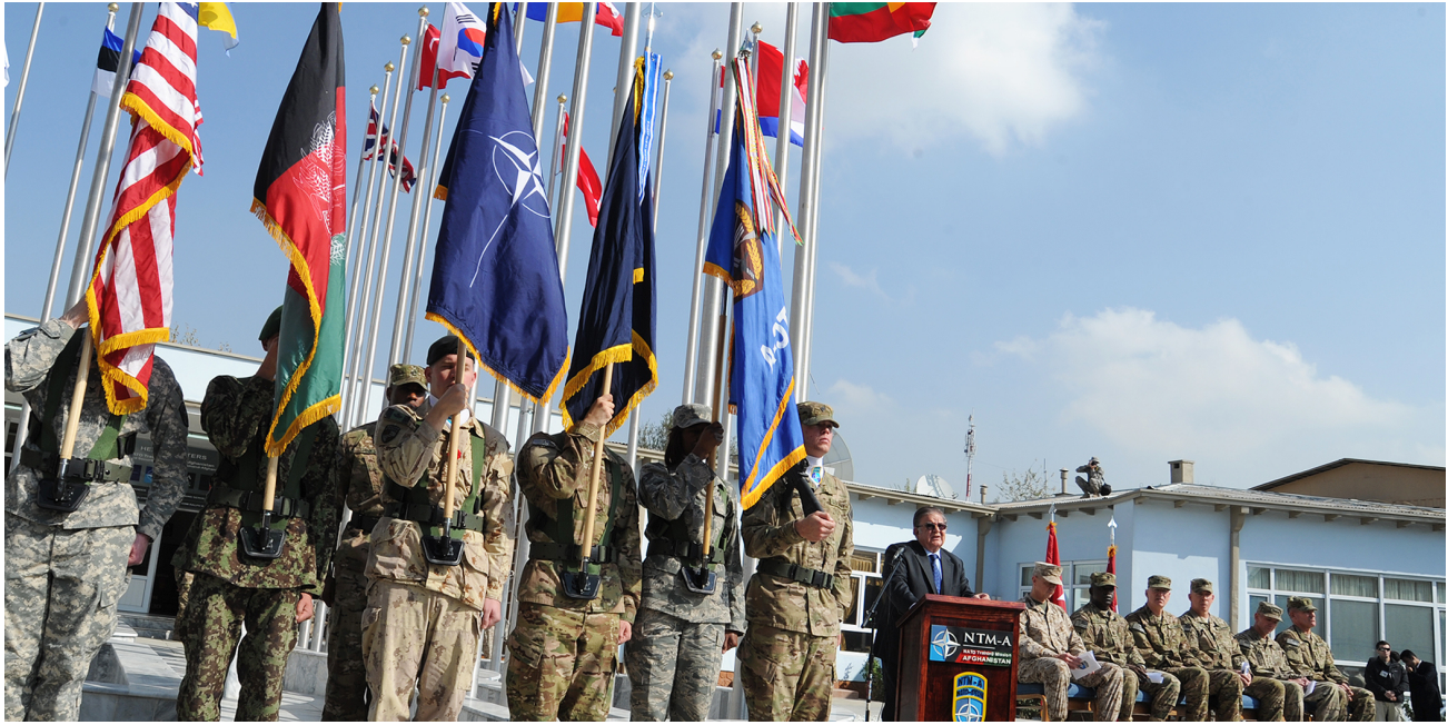
Kabul, Afghanistan. Afghanistan Minister of Defense Abdul Rahim Wardak gives a speech during a NATO training mission.

has made a lot of things available. The question isn't whether the United States is helping Taiwan, the question is whether it's sufficient.