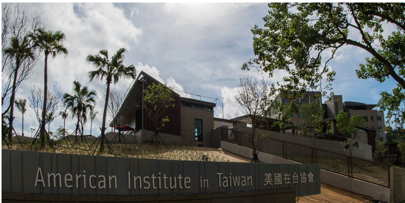
Taipei, Taiwan. The American Institute in Taiwan's office complex in Taipei.

GS: Yes, Taiwan is spending real money and the United States