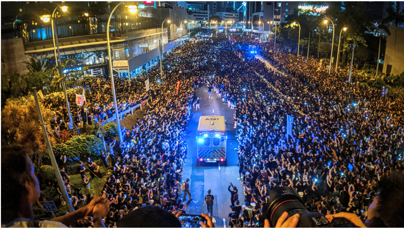
Hong Kong. Protestors make way for an ambulance during a protest against the 2019 Hong Kong extradition bill.