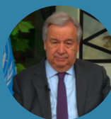
António Guterres, Secretary General of the United Nations on the State of Food Security and Nutrition in the world.

“In a world of plenty, no one should go hungry. And no one should suffer the cruelty of malnutrition. But this report on the State of Food Security and Nutrition paints a stark picture of our reality. [...] More than 3 billion can't afford a healthy diet.”