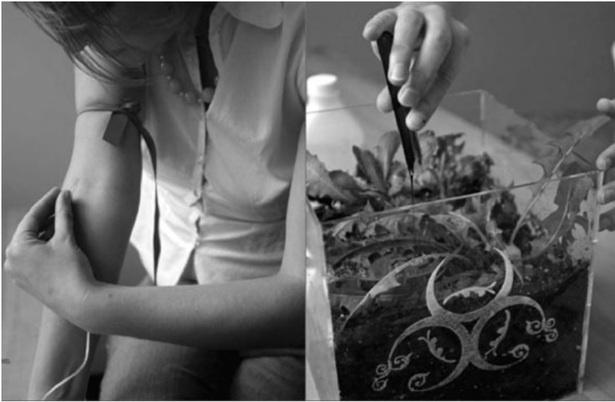
FIGURE 3. "Lifecycle of a Common Weed" by Caitlin Berrigan.

Noting that the recipient of her nurturing gesture is regarded as a "weed," Berrigan worked to give the dandelion biographical and political life ( bios ), elevating it from the realm of bare life. "The dandelion actually has a lot to offer us even though they grow everywhere, and are killed with herbicides," she later told us (see also Berrigan 2009). Berrigan's art and personal medical regimen might be understood as a "microbiopolitical" intervention, calling attention to how living with microorganisms (in this case, a pathogenic virus) is caught up in discourses about how humans ought live with one another (Paxson 2008:16). Appropriating tools of biotechnology and syncretic medical traditions, she worked to create a symbolic cycle of nutrients in urban environments, on a micro local scale, in opposition to dominant institutionalized practices and global commodity chains (cf. Paxson 2008:40).