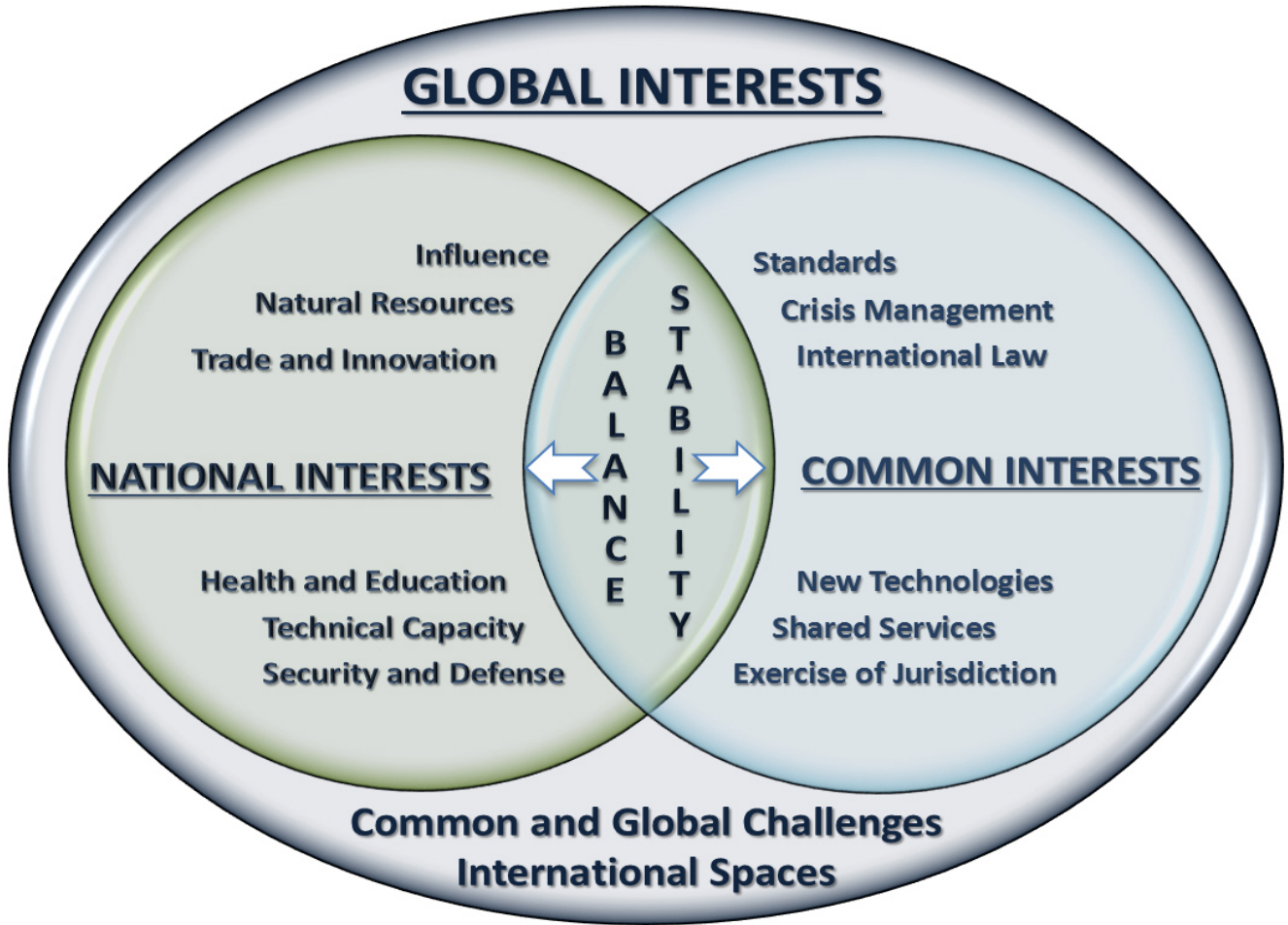
FIGURE 5: Global interests of our civilization – which is now interconnected across the Earth (Fig. 1) – require balance between national interests and common interests with urgencies across security and sustainability time scales (Fig. 2).

Among the nearly 200 nations in our world, seven Foreign Ministers now have S&T Advisors. The Vienna Dialogue (Table 1) is a tribute to Dr. Vaughan Turekian (United States), Sir Peter Gluckman (New Zealand), Prof. Robin Grimes (United Kingdom), Dr. Teruo Kishi (Japan) and Prof. Aminata Sall Diallo (Senegal). These S&T Advisors to Foreign Ministers and their predecessors are the pioneers of a global network (Table 3), establishing a new level of diplomacy across foreign ministries 33-34 at the intersection of national interests and common interests on a global scale (Fig. 5).