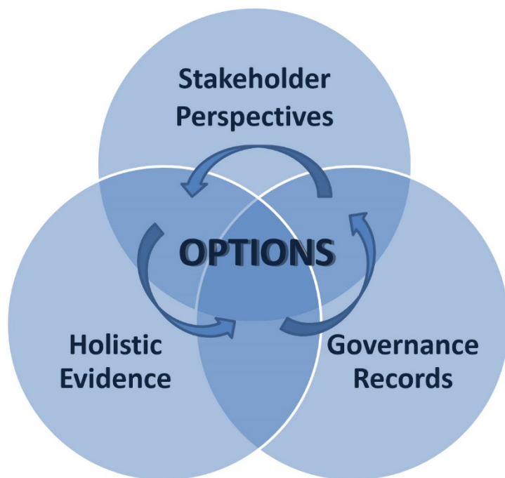
FIGURE 3: Iterative decision-support process involving international, interdisciplinary and inclusive (holistic) evidence from the natural and social sciences that is integrated with governance records (policies, regulations and laws of governments) in view of stakeholder perspectives to reveal options (without advocacy) that contribute to informed decision-making for the foreign affairs of nations.

In a general sense, options are integrated through a decision-support process (Fig. 3), responding to constantly changing circumstances within, across and beyond the boundaries of nations. This iterative process involves stakeholder perspectives; evidence that is holistic (international, interdisciplinary and inclusive); and governance records.