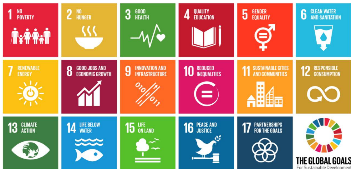
FIGURE 4: The 17 Sustainable Development Goals established by the United Nations in 2015. 26

In an holistic manner, the Sustainable Development Goals (Fig. 4) are characterized as a “ knowledge platform... a plan of action for people, planet and prosperity. ” While they were crafted in a political environment with urgencies of the moment – these goals offer humankind a timeless gift that is purposeful today and will continue to be so into the distant future.