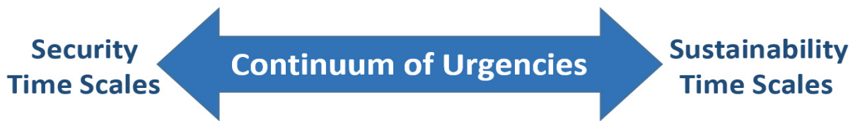
FIGURE 2: In our globally-interconnected civilization today, urgencies exist simultaneously across security time scales (mitigating risks of political, economic and cultural instabilities) and sustainability time scales (balancing societal, economic and environmental elements across generations) that must be addressed by nations individually and collectively.

In our globally-interconnected civilization – where urgencies of the present and future meet today (Fig. 2) – science and technology (S&T) advice in foreign ministries is part of the solution to address the issues, impacts and resources within, across and beyond the boundaries of nations. 10 In foreign ministries, the ‘evidence brokers’ are the science and technology advisors to foreign ministers.