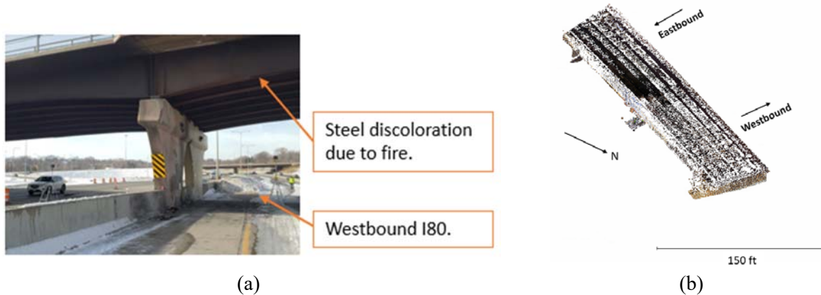
Figure 1. The case study structure: (a) bridge view including lidar scanners deployed for point cloud collection, and (b) isometric view of aligned point cloud.

The out-of-plane deformation of select girder webs was analyzed via a depth-map approach. This was performed using a single point cloud that eliminates the registration error. An out-of-plane depth-map analysis enables each vertex of the point cloud to be classified based on its distance from a reference plane [3], as shown in Figure 2. In this case, the reference plane coincides with the plane of the girder’s web, where positive out-of-plane deformation values are oriented eastbound and negative deformation values are oriented westbound. The depth-map analysis classified the deformation of the web up to one-hundredth of an inch, which is presented visually by color at the same resolution. In addition, the measurements of range, maximum, minimum, and median out-of-plane deformation values for each girder (at 99% to minimize any remaining noise) are identified in Table 1. The out-of-plane deformation values are reported as a range value to indicate the amount of potential buckling or the lack of planarity in the girders.