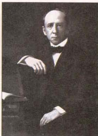
Lucien Lucius Nunn: a kind of genius

Of Deep Springs's many idiosyncrasies, it's the self-government that makes the place truly stand out. The students themselves make almost all the important decisions about their education, the environment in which they live and the future of the school itself. The student body votes on everything, choosing the subjects they